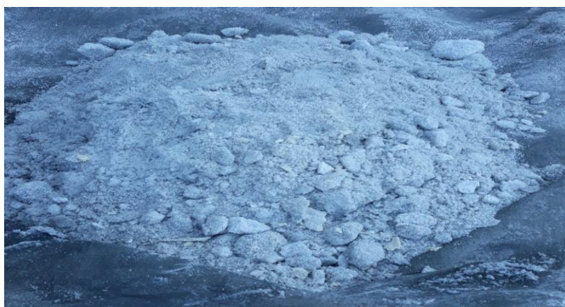
Fig. 3. Appearance of the obtained sodium sulfate

Comparison of the chemical composition of desulfated solutions shows that the degree of sodium sulfate extraction from GOU solutions is within 36-68%. This depends on the cooling temperature of the solutions and the initial chemical composition. In general, it can be stated that reaching a temperature of 4 °C in the GOU solution is sufficient for its regeneration from sulfur compounds and the formation of crystalline sodium sulfate (Fig. 3). Accordingly, the regulating parameter (due to the impossibility of influencing the ambient temperature) is the cooling time of the solution in a container located outside and the temperature of the atmospheric air. There is an option to intensify the process by installing refrigeration equipment, but this will lead to an increase in the cost of the process.